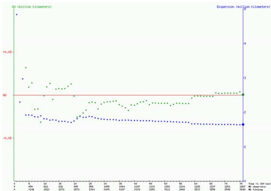
Evolution of the calculated average and dispersion of the AU before June 18

So we may say that the overall effect of the constrained system was in fact to improve artificially the “quality” of the observations for the calculation of the AU. However, as in the non-constrained method, the geographical site of observation still played an important role and it is not possible to compare results from one site to another, neither in the constrained system nor in the non-constrained.